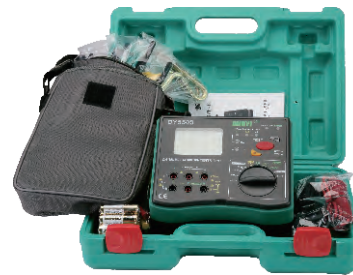
Standard package and complete accessories